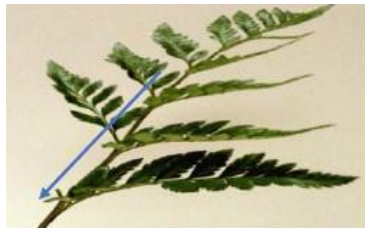
Figure 1.9 Enter from right side toward focal point

Note for photos: Arrows depict radial direction