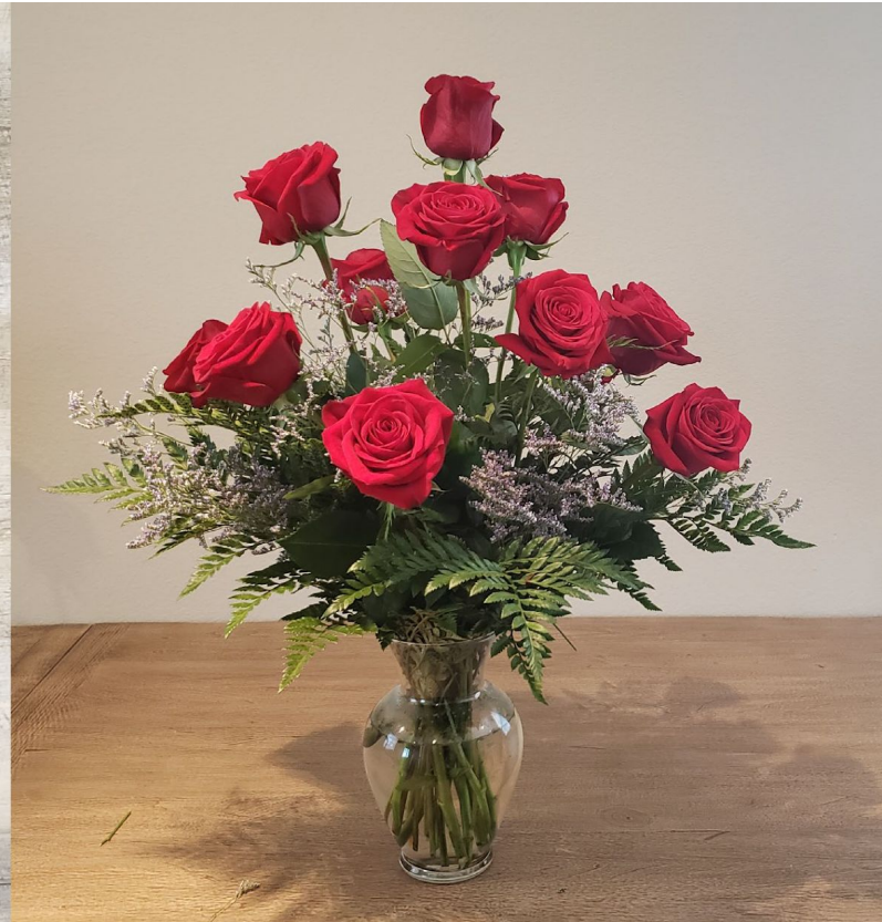
Figure 1.8 Front View of Dozen Roses Vase Arrangement