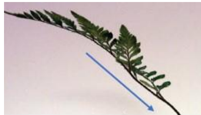
Figure 2.0 Enter from left side toward focal point