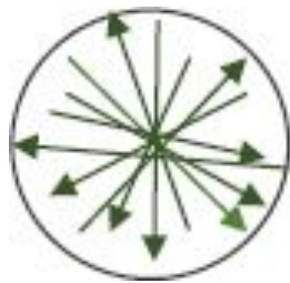
Figure 1.6 Top View of Crisscross Stem Insertions Into Vase to Create a Grid