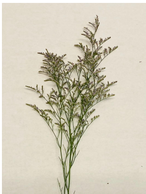
Figure 1.2 Misty, Limonium