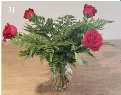
Figure 2.2 Layer 1 – add 4 Roses