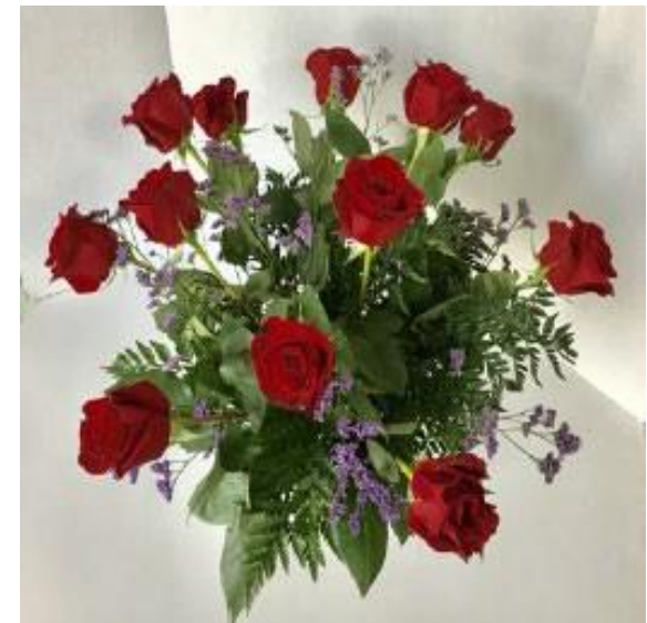
Figure 2.8 TOP VIEW 12 Rose Stems with Leather Leaf and Purple Limonium