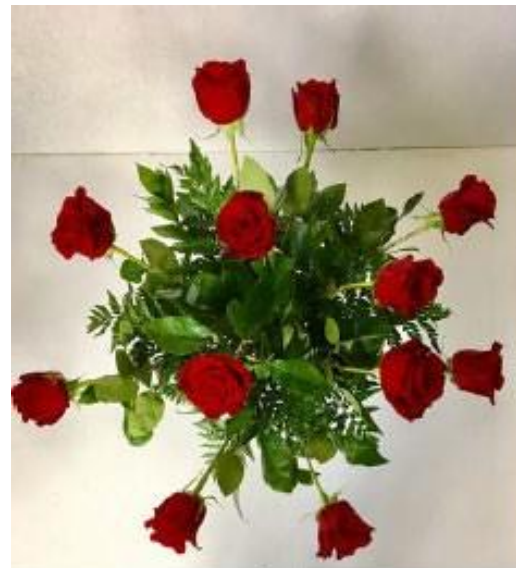
Figure 2.7 TOP VIEW 12 Rose Stems with Leather Leaf