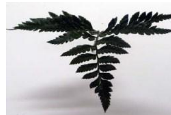
Figure 2.1 Enter from front center toward focal point