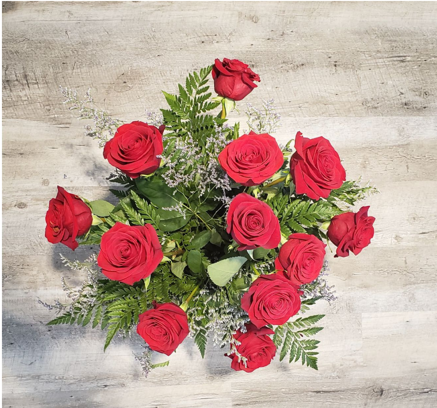
Figure 1.7 Top View of Dozen Roses Vase Arrangement