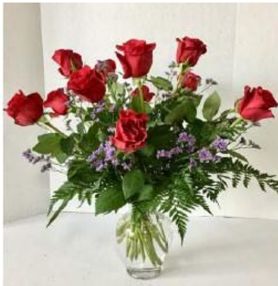
Figure 2.6 SIDE VIEW 12 Rose Stems with Leather Leaf and Purple Limonium

12 Red Roses, 14 Stems of Leather Leaf and 1/3 Bunch of Limonium Filler