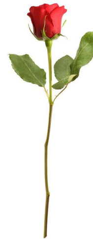
Figure 1.0 Stem should be approximately 22" – 26"