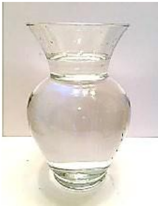
Figure 1.5 8 3/4" Tall Vase