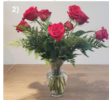
Figure 2.3 Layer 2 – add 4 Roses

Consists of 4 more Roses (there should now be 8 Roses in the vase)