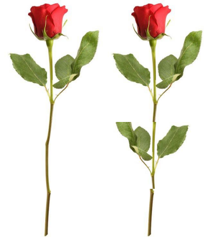
Figure 1.1 Remove any foliage from stem that will be under water