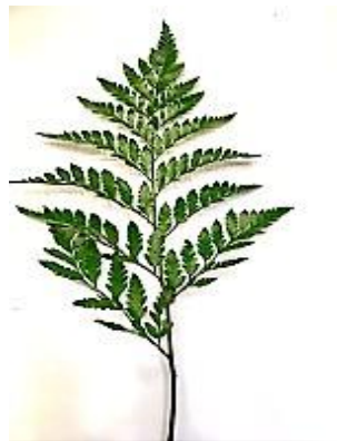
Figure 1.3 Leather Leaf