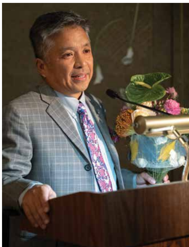
Sogueco expresses appreciation to TSFA for this recognition.