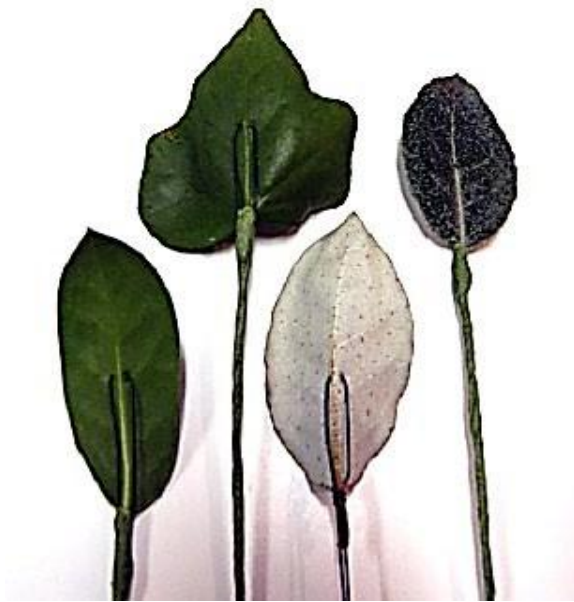
Stitch Wiring With #28 Wire