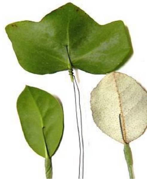
Hairpin Wiring With #28 Wire

Using the stitch method. Wire and tape halfway down the wires, preparing five leaves.